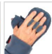
Finger separator included