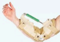
Elbow, p. 377